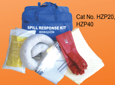
Cat No. HZP20, HZP40

In a convenient Carry Bag, this Kit is ideal for commercial painters. 20L, 40L