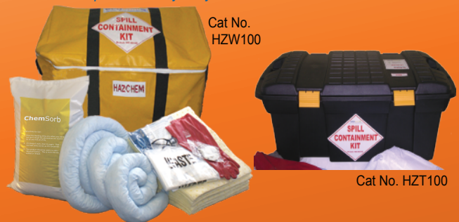
Cat No. HZW100

100L size, comes in a Waterproof portable bag. Also available in an optional Heavy Duty Trunk.