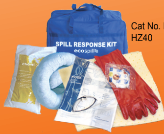
Cat No. HZ20, HZ40