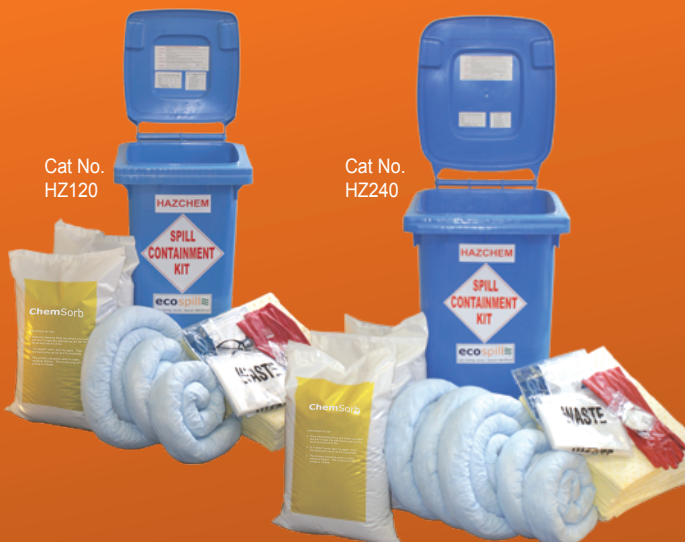
Cat No. HZ120

Ideal for small to large workshops, these Kits are ideal for Paint Shops, Panel Beaters, and any factory where chemical are manufactured or stored.