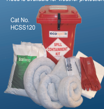
Cat No. HCSS120

Fitted with a Clip Lock for protection against unwanted rubbish. Optional Bin Hood is available for weather protection.