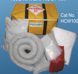
Cat No. HCW100