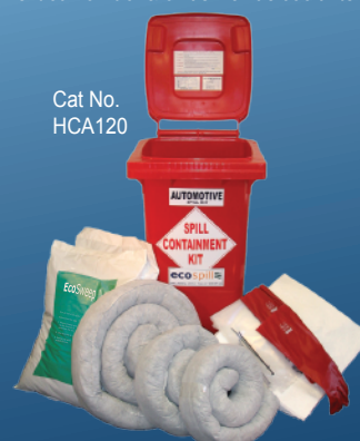
Cat No. HCA120

In a Wheelie Bin, this general purpose kit is ideal for fuel & oil as well as coolants.