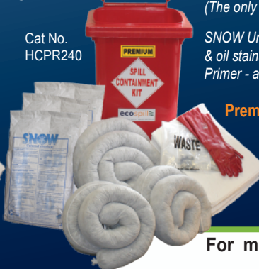
Cat No. HCPR240