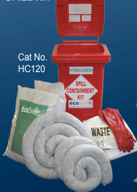
Cat No. HC120