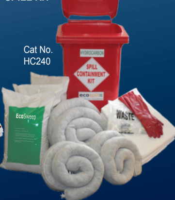
Cat No. HC240