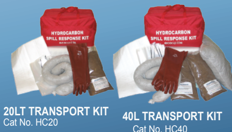
20L TRANSPORT KIT Cat No. HC20

In a convenient Carry Bag, perfect for Truckies, Bus Drivers & Mobile Technicians. Available in 20L, 40L & 100L sizes.