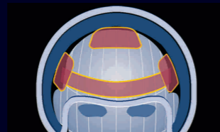
Additional padding set for individual fitting