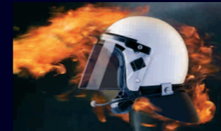
Enhanced flame protection