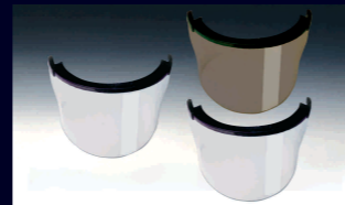
Visors 5mm, PinLock®, tinted, long, short